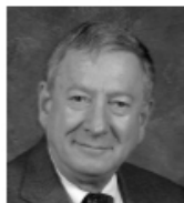
Alfred G. Gilman, M.D., Ph.D.

ALFRED G. GILMAN, M.D., Ph.D., 63, a co-founder of the Company, has been a Director of the Company since July 1990. Dr. Gilman has been the Raymond and Ellen Willie Professor of Molecular Neuropharmacology and Chairman of the Department of Pharmacology at The University of Texas Southwestern Medical Center at Dallas since 1981 and was named interim dean of Southwestern Medical School in May 2004. Dr. Gilman is a member of the National Academy of Sciences. He is the Consulting Editor of "Goodman and Gilman's The Pharmacological Basis of Therapeutics," the leading medical pharmacology textbook. Dr. Gilman received the Nobel Prize for Physiology or Medicine in 1994. Dr. Gilman is a member of the Board of Directors of Eli Lilly & Company.