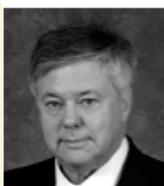
Michael S. Brown, M.D.