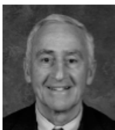
P. Roy Vagelos, M.D.

P. ROY VAGELOS, M.D., 75, has been Chairman of the Board of the Company since January 1995. Prior to joining Regeneron, Dr. Vagelos was Chairman of the Board and Chief Executive Officer of Merck & Co., Inc. He joined Merck in 1975, became a director in 1984, President and Chief Executive Officer in 1985, and Chairman in 1986. Dr. Vagelos retired from all positions with Merck in 1994. Dr. Vagelos is the Chairman of the Board of Theravance, Inc.