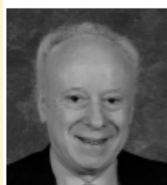
Joseph L. Goldstein, M.D.

ALFRED G. GILMAN, M.D., Ph.D., 63, a co-founder of the Company, has been a Director of the Company since July 1990. Dr. Gilman has been the Raymond and Ellen Willie Professor of Molecular Neuropharmacology and Chairman of the Department of Pharmacology at The University of Texas Southwestern Medical Center at Dallas since 1981 and was named interim dean of Southwestern Medical School in May 2004. Dr. Gilman is a member of the National Academy of Sciences. He is the Consulting Editor of "Goodman and Gilman's The Pharmacological Basis of Therapeutics," the leading medical pharmacology textbook. Dr. Gilman received the Nobel Prize for Physiology or Medicine in 1994. Dr. Gilman is a member of the Board of Directors of Eli Lilly & Company.